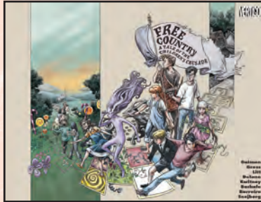
FREE COUNTRY: A TALE OF THE CHILDREN'S CRUSADE HC DC COMICS