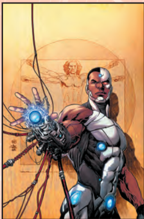
CYBORG #1 DC COMICS