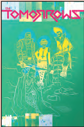
THE TOMORROWS #1 DARK HORSE COMICS