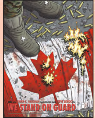
WE STAND ON GUARD #1 IMAGE COMICS