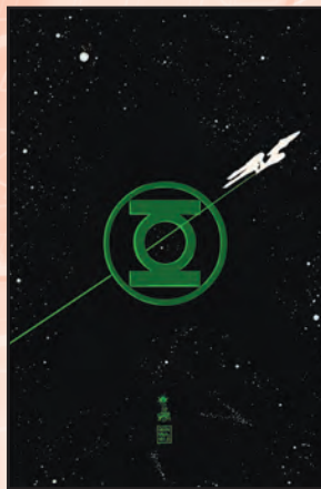
STAR TREK/ GREEN LANTERN #1 IDW PUBLISHING