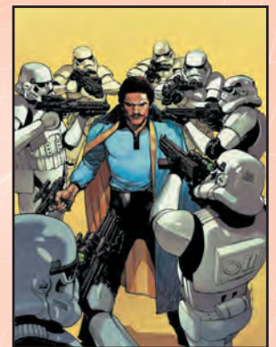
STAR WARS: LANDO #1 MARVEL COMICS