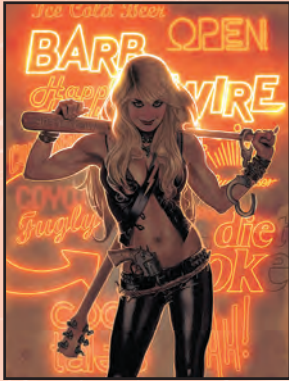
BARB WIRE #1 DARK HORSE COMICS