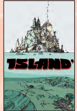
ISLAND #1 IMAGE COMICS